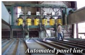
Automated panel line