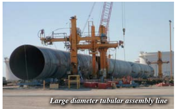
Large diameter tubular assembly line

Vessels can be loaded onto owner-furnished barges, or clients can take advantage of Gulf Island Fabrication's effective turnkey package. Subsidiary Gulf Island Marine Fabricators, located in Houma, Louisiana, along the Houma Navigation Canal, offers tank barge construction as a value-added service to our pressure vessel clients.