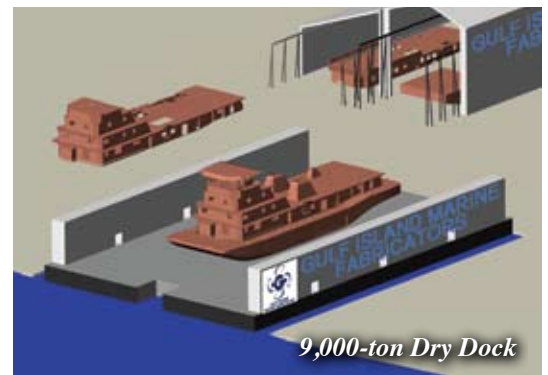
9,000-ton Dry Dock