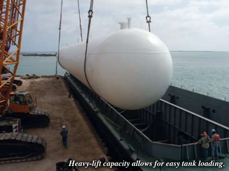
Heavy-lift capacity allows for easy tank loading.